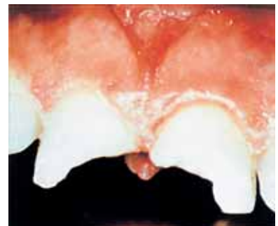
Fracture of 11 and 21 in the anterior area

The pleasant process paired with the outstanding characteristics and the universal applicability of Megafill MH stand for a high quality and long lifetime of the restoration.