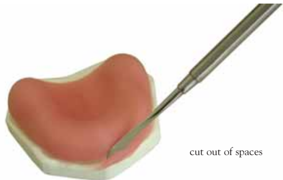
cut out of spaces