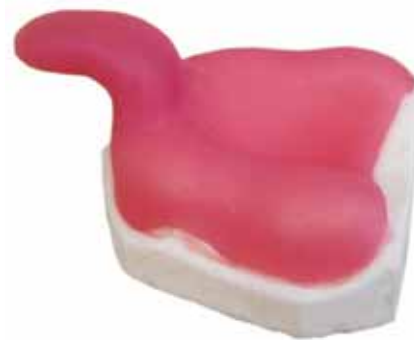
individual custom tray