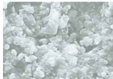
REM image of comparison product Surface