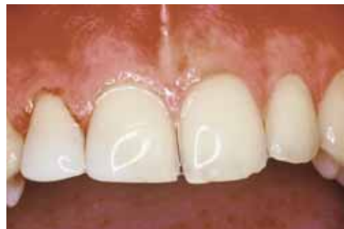
treatment with N-Fill and N-Fill Flow