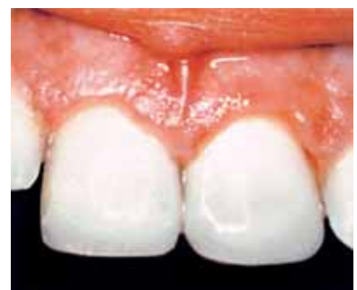
Esthetic and functional results with Megafill MH treatment