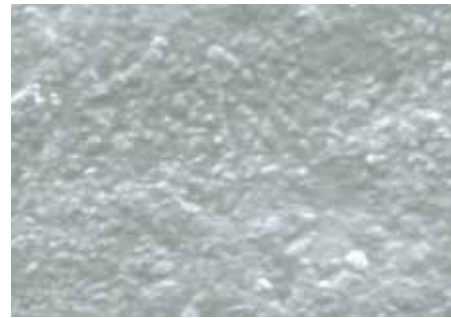
REM image of C-Fill MH surface

The measured filler combination ensures a concise chameleon effect, a natural opalescence through the Rayleigh dispersion of the visible light and high gloss polish capability. These properties lend a natural esthetic looking to the placed filling. C-Fill MH is X-ray opaque and available in a wide variety of shades.