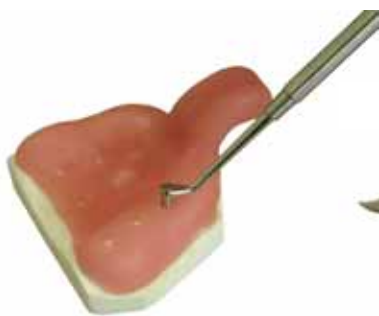
perforation of the final tray

The Perfmaster is a carving instrument for fast and time saving modulation of light curing tray material, e.g. MEGATRAY. The wafers can now easily cut and contour on the plaster model, because of the sickle form of the carving instrument. The additional round stamp of the instrument is suitable to make a perforation of the final modulated tray. This perforation makes mechanical retention possible and reduce the working time on the finish cured tray. The additional use of an adhesive for impression material is not required.