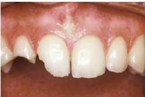
corona fracture before treatment